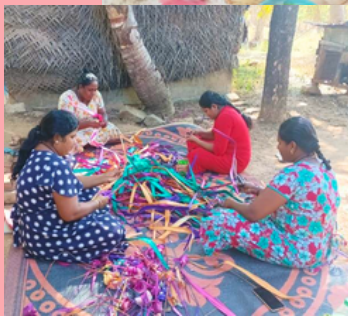
The Savings Group participating in a nutrition program and making palm products.