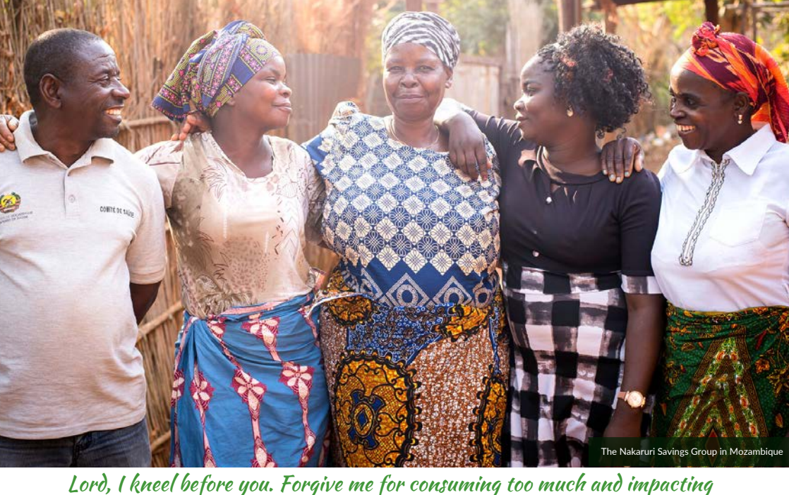
Lord, I kneel before you. Forgive me for consuming too much and impacting negatively on the lives of others. Help me to see and care for all your people. Compel me in your love to respond as a good neighbour. Amen